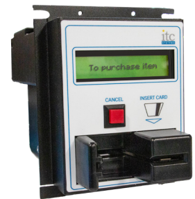
netZcom Online Vending Terminal